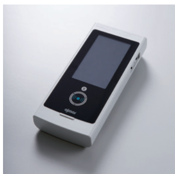
NFC WIRELESS PROGRAMMER