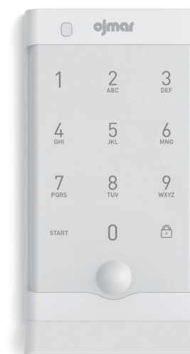
OCS®SMART White Handle