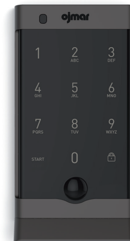
OCS®SMART Graphito Handle